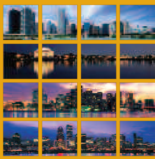
Building A Successful Future