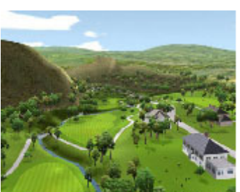
Figure 4 - PGA Tour Golf