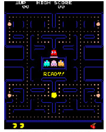
Figure 1 - PACMAN

An author can also choose to register the copyright with the U.S. Copyright Office (current registration fee is $45), v provides certain additional benefits, such as the right to statutory damages for copyright infringement. Copyrights historically regarded of as the only form of "substantive" intellectual property protection for computer software, but couldn't be farther from the truth.